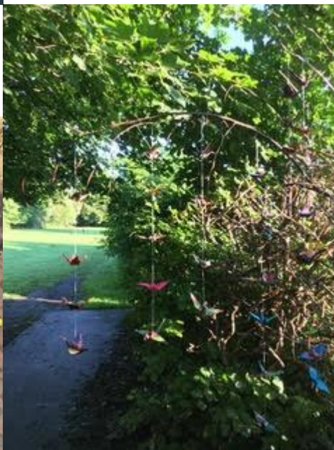
South East Group