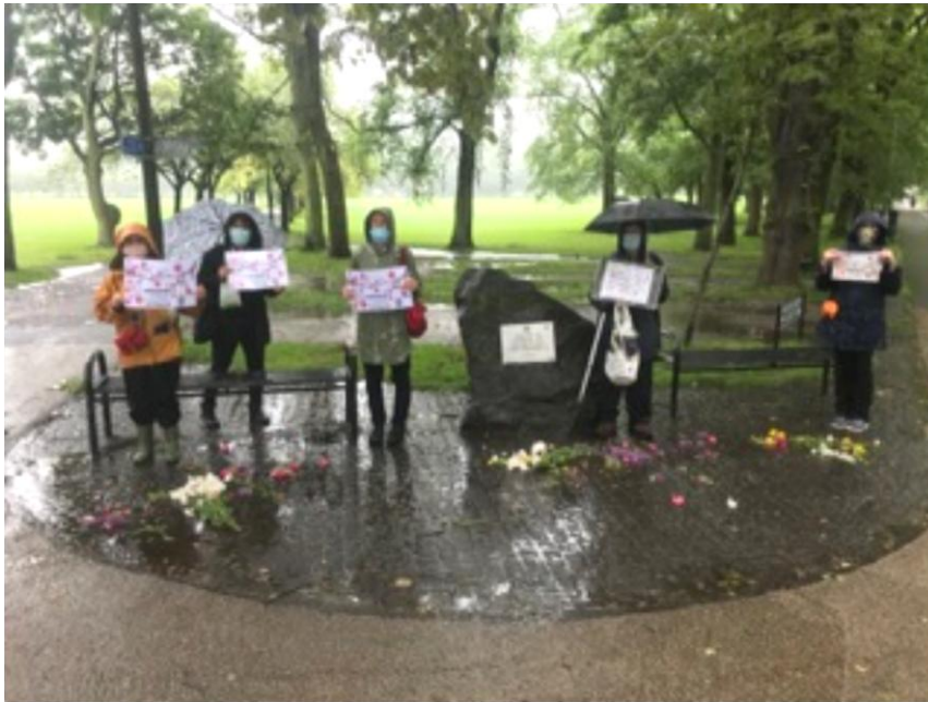
Out of town group. Displays of paper cranes, placards and flowers were put up in Melrose and Belle's garden in the Borders.

So wet! We didn't have many people pass us and most were scurrying past us. We did try to speak to folk and remind them of Hiroshima and Nagasaki anniversaries. We stood for half an hour as we agreed we would but got wet to the bone in that time.